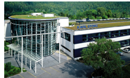
KARL STORZ Headquarters / Training Center