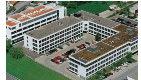
KARL STORZ Production/R&D