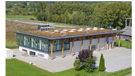
KARL STORZ Visitor Center