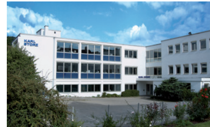
KARL STORZ Administration / Museum