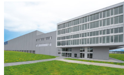
KARL STORZ Logistics Center